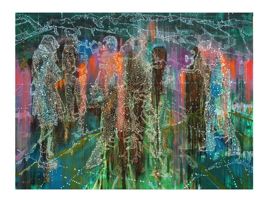
Jon Cattapan, Fall of the Valley Kings, 2016, oil on linen, 185 x 250 cm Courtesy of the artist, Station Gallery, Melbourne & Dominik Mersch Gallery, Sydney Photography: Jon Cattapan