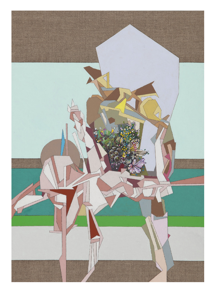
Raafat Ishak, Paw Paw , 2011, oil on cotton duck, 42.5 x 30 cm