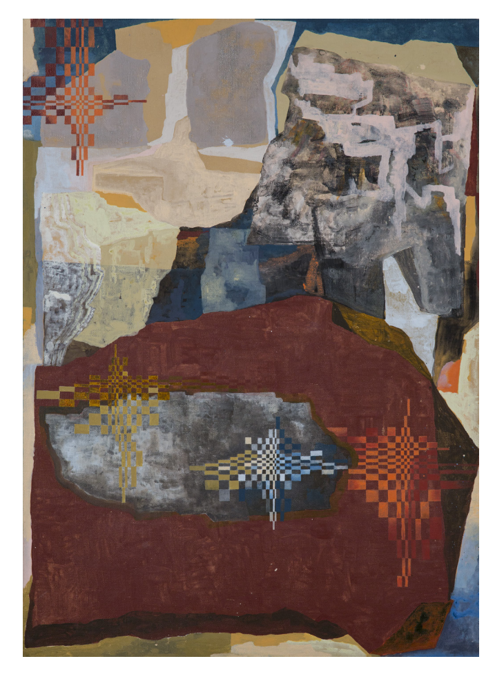
Ruth Waller, Bellini Revisited , 2013, acrylic on linen, 108 x 76 cm