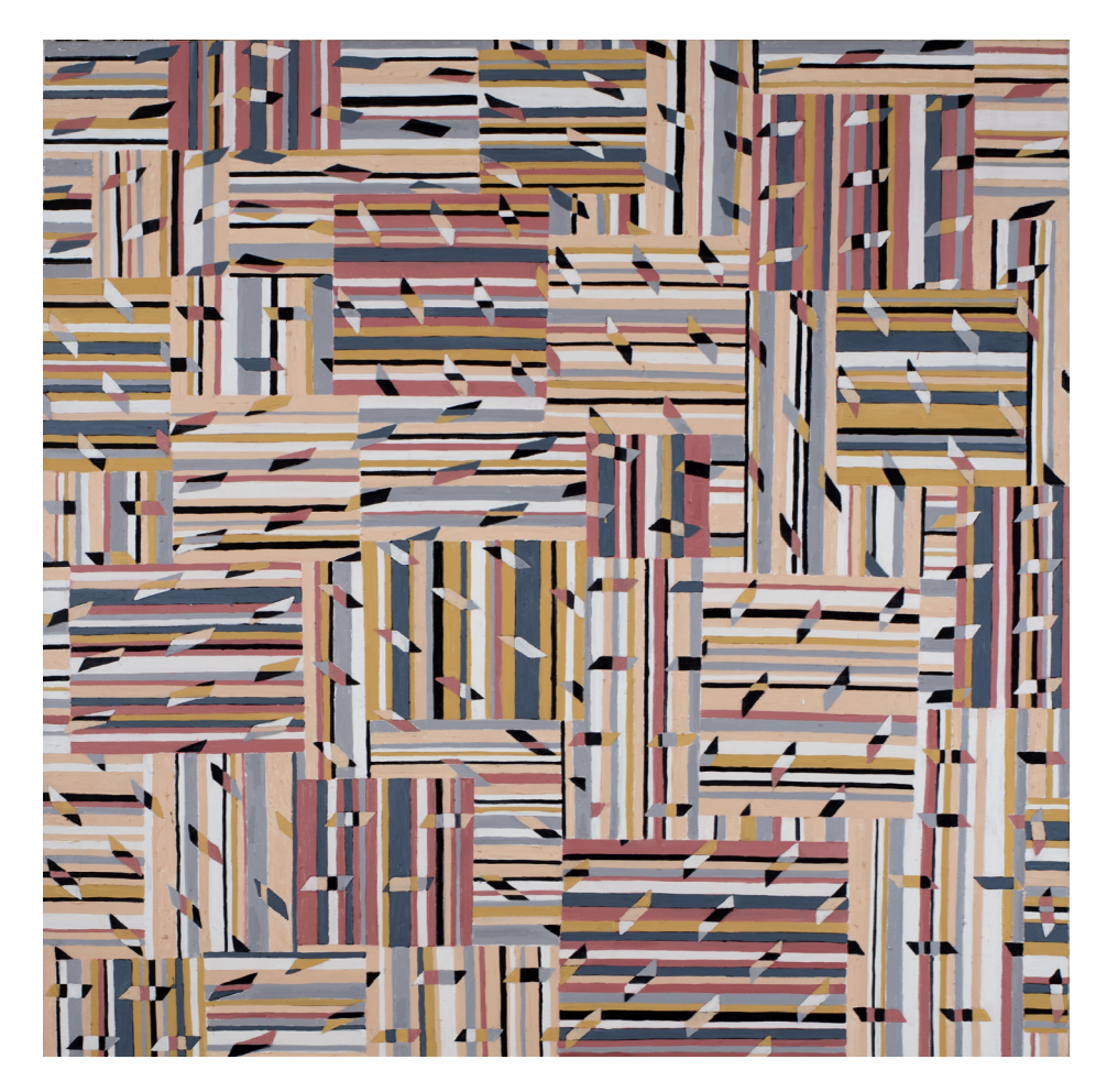
Kerry Gregan, Shovin, 2007, oil on canvas, 152 x 152.5 cm On loan from the collection of Poppy & Crosby Lyne, Tasmania