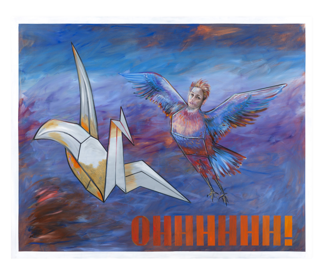
Juan Davila, Ohhhhhh!, 2014, oil on canvas, 200 x 250 cm